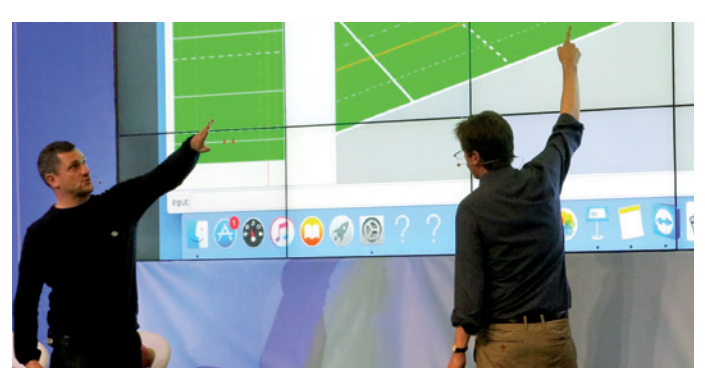
Ex-England rugby player Paul Grayson discusses with Rob Eastaway where best to locate the ball for a conversion