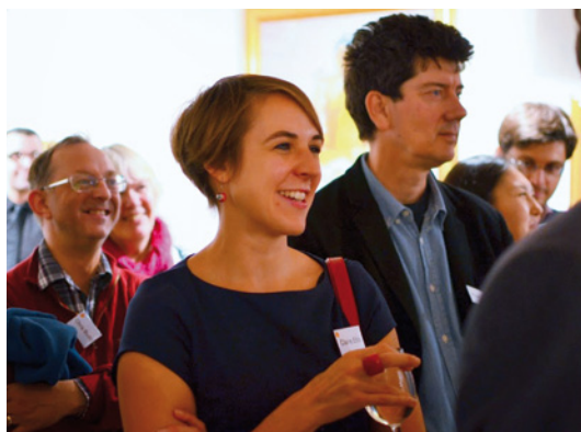
Our 10th anniversary reception

2014–15 was the tenth anniversary of Maths Inspiration. In ten years, over 100,000 teenagers have attended one of our shows, in 40 different theatres and concert halls around England and Wales. To celebrate we held a reception at London's OXO Tower gallery for supporters, speakers, teachers and representatives of a wide range of maths bodies.